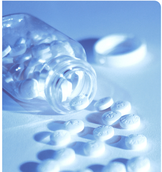
Aspirin can play an important role in preventing stroke because it helps keep blood from clotting.

Sometimes a stroke is the first sign a person has of other health conditions, such as high blood pressure, diabetes, atrial fibrillation (a heart rhythm disorder) or other vascular disease. If any of these are diagnosed, the health care team will prescribe appropriate treatment.